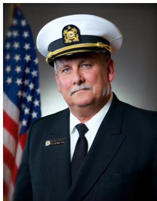
Commodore Rickey Pope